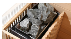
Sawo Finnish sauna stove

150 × 105 × 190 cm | Indoor Finnish sauna for 2 people Canadian hemlock tree | 8-mm thick safety glass door and sides fixed floor grid | removable stove protection grid heat-resistant luminary with wood panel | ventilation holes Sawo furnace for Finnish sauna: 4.5 kW/220 V | lava rock heat and humidity meter | wooden pail with spoon | sandglass