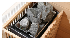
Sawo Finnish sauna stove

200 × 170 × 210 cm | Indoor Finnish sauna for 5-6 people Canadian hemlock tree | 8-mm thick safety glass door and sides fixed floor grid | removable stove protection grid heat-resistant luminary with wood panel | ventilation holes Sawo furnace for Finnish sauna: 9 kW/380 V | lava rock heat and humidity meter | wooden pail with spoon | sandglass